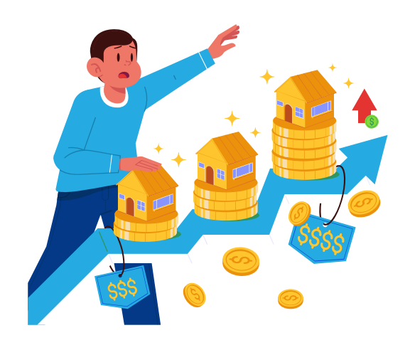
Complex management to earn rental income from real estate