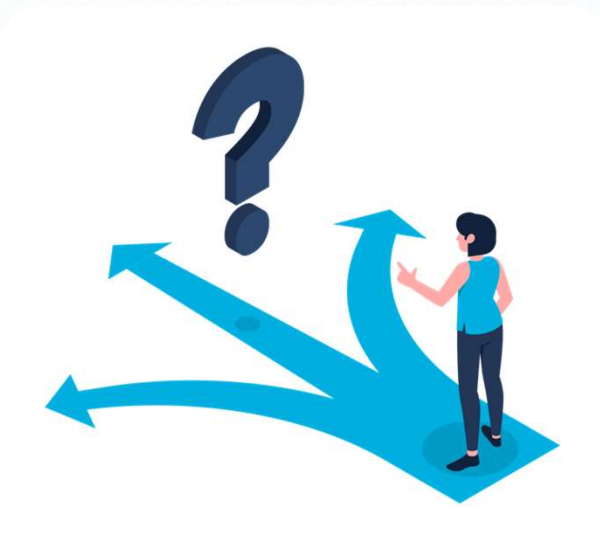
Limited flexibility and accessibility for everyday investors