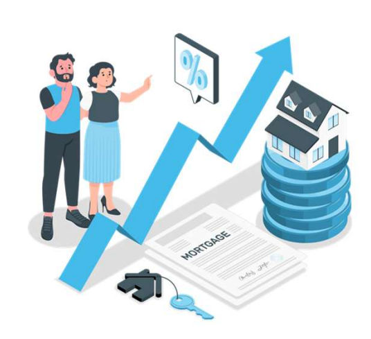
High entry costs and complex ownership processes